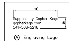
Ⓐ Engraving Logo